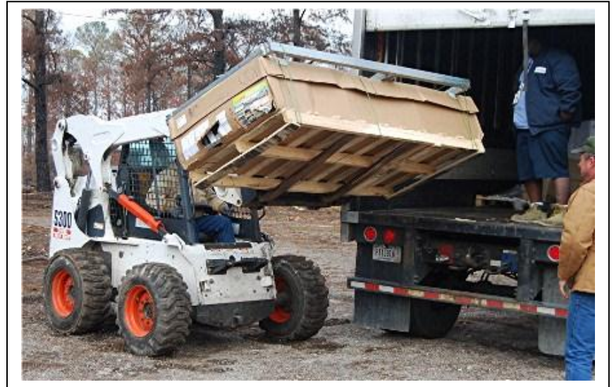
The Friends take delivery of our new Greenhouse for the Park A workday will be scheduled soon to assemble it. We will be asking for help when it is scheduled.