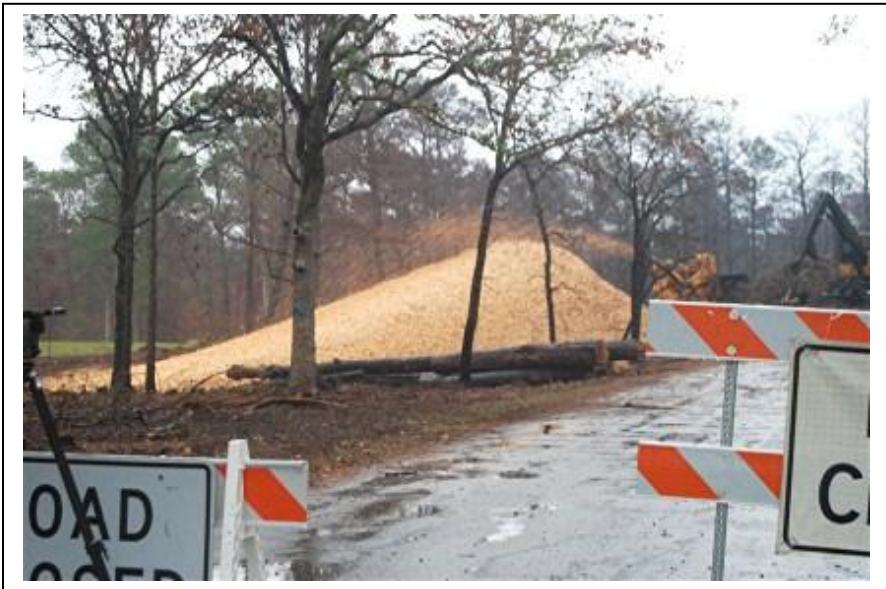
Except those areas still being cleared and where the chippers are working, Park Road 1A is open to the public. Everyone needs to come out and see how the Park is coming back!