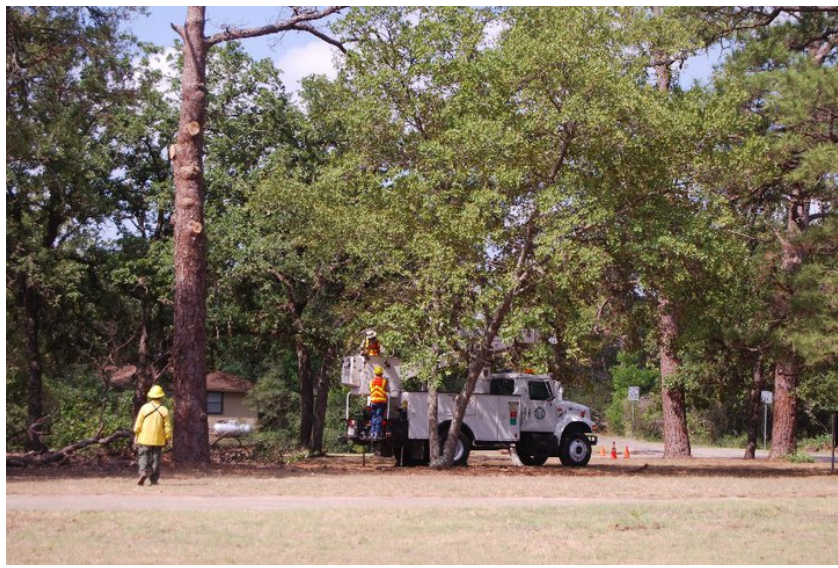
A Texas Parks and Wildlife Department crew is shown taking down a dead Pine tree in front of the Bastrop State Park Refectory. The dry conditions this year has had us under a fire ban at both Parks most of the year.