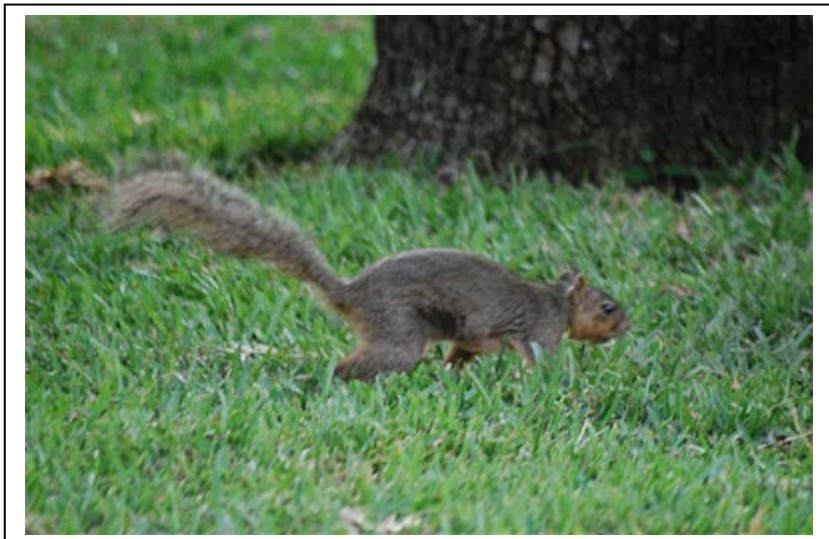
A furry friend checks out the new grass at the restored Bastrop State Park Swimming Pool