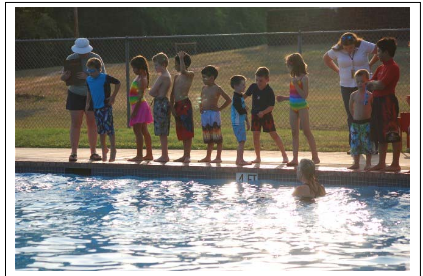
Students preparing for their first class

All the funds raised from this project goes back into the Park by the Friends sponsoring events and buying equipment for both our Parks. This year, we have had a great start to our record year and we still have one more session to go.