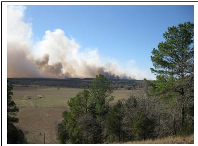
Another view of the Bastrop-Buescher fire. The fire did not reach the Parks, but as you can see was close!

It was purchased from the Texas Power and Light Company in Coleman, Texas and shipped to the Park in 1935