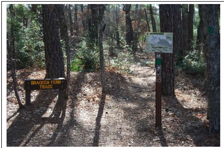
One of the many trails in Bastrop and Buescher State Parks