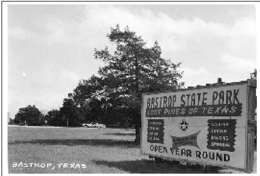
This is the entrance of Bastrop State Park in the 1950's