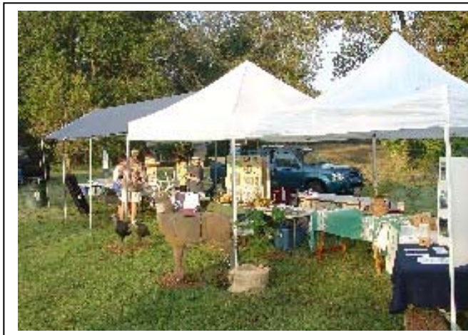
Lost Pines Tents at NatureFest, November 3 rd , 2007