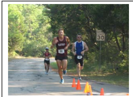
Our Bastrop State Park 2010 Extreme Team