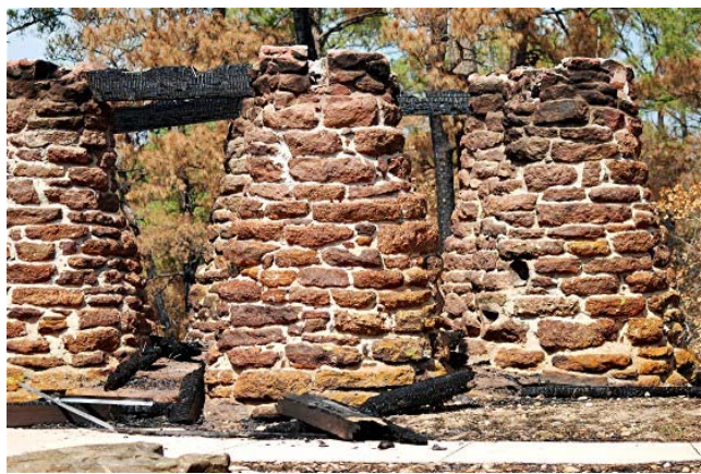
Both Overlooks Burned but all other CCC buildings saved!