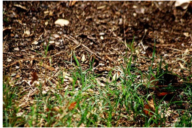
Life finds a way to survive and return!