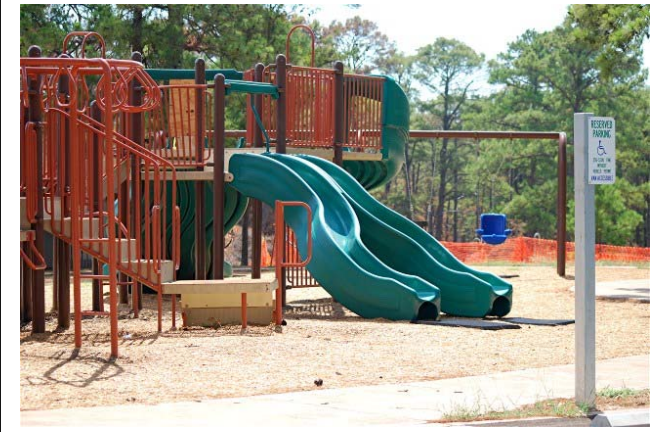
Our Playground is safe and note the green around it!