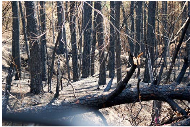
Devastation in the Park