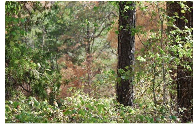
Islands of Green exist and are being nurtured!