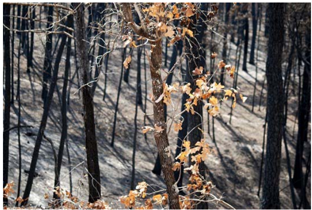
About 95% of our Park has burned