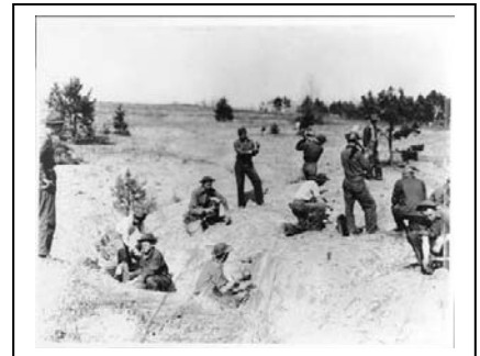
Above: CCC planting trees was one of the first chores for Bastrop and Buescher State Parks.

In this 1932 photograph, we see the area that would become part of Bastrop State Park before construction was started. As you can see, there is very little grass or trees. Erosion was a serious problem. Bastrop County was undergoing a drought and heat spell just like we are now. There had also been a lot of tree harvesting. This is why one of the first jobs for the CCC was planting trees.